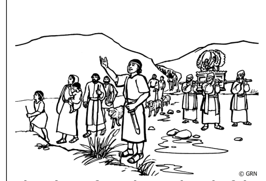
The priests of Israel carry the Ark of the Covenant with the Ten Commandments across the bed of the River Jordan

The people believed what God told Joshua. They obeyed and they got ready to go across the Jordan River. The priests who carried the Ark of the Covenant went ahead of them (3:14). They knew the river was in flood and that the waters led into the Dead Sea!