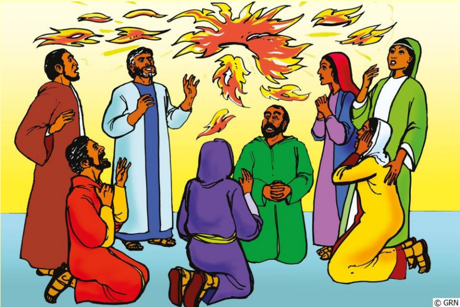
The Holy Spirit descends upon the followers of Jesus