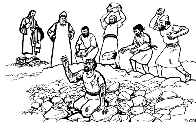
The apostle Stephen stoned to death watched by Saul