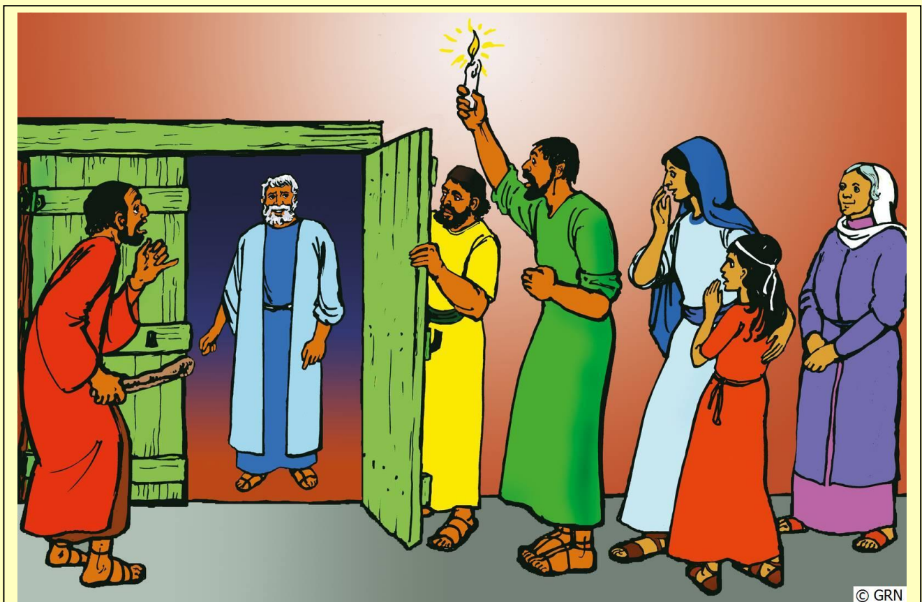
The friends of Peter are surprised to see him free from prison

At once Peter's chains fell off and he followed the angel. They walked past the guards and went out through the gate into the city. Peter did not know what was happening until the angel left him. Then he knew it