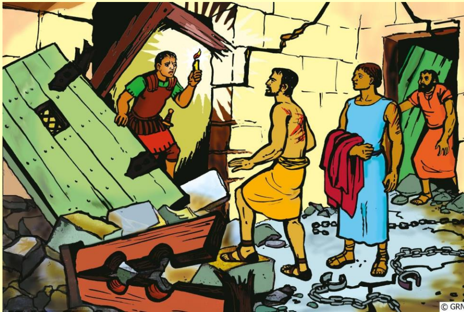
Paul and Silas in an earthquake