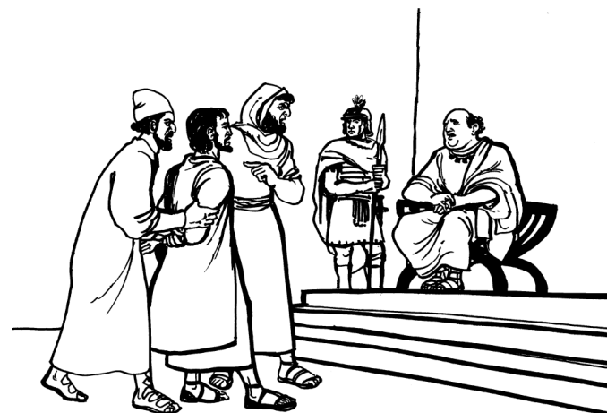
Paul is taken to court