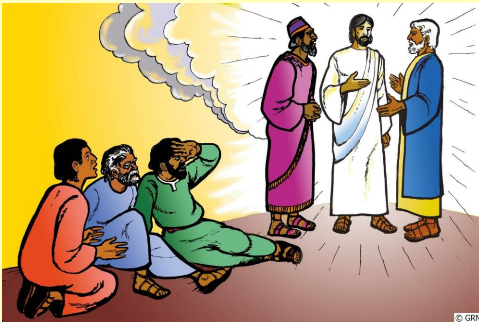
The transfiguration of Jesus