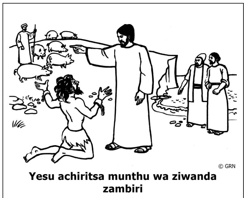
Yesu achiritisa munthu wa ziwanda zambiri

M'mbali mwa nyanja munalinso manda, mapanga amene anthu anali kuyikamo akufa awo. Munthu waziwanda anali kukhala kumeneko (5:3). Mizimu yonyansa inamupangitsa iye kukhala wa mphamvu ndi wa ukali. Anthu anayesa kumumanga ndi maunyolo koma anali kudula ndi kuthawa. Munthuyu atamuwona Yesu akutsika mu bwato