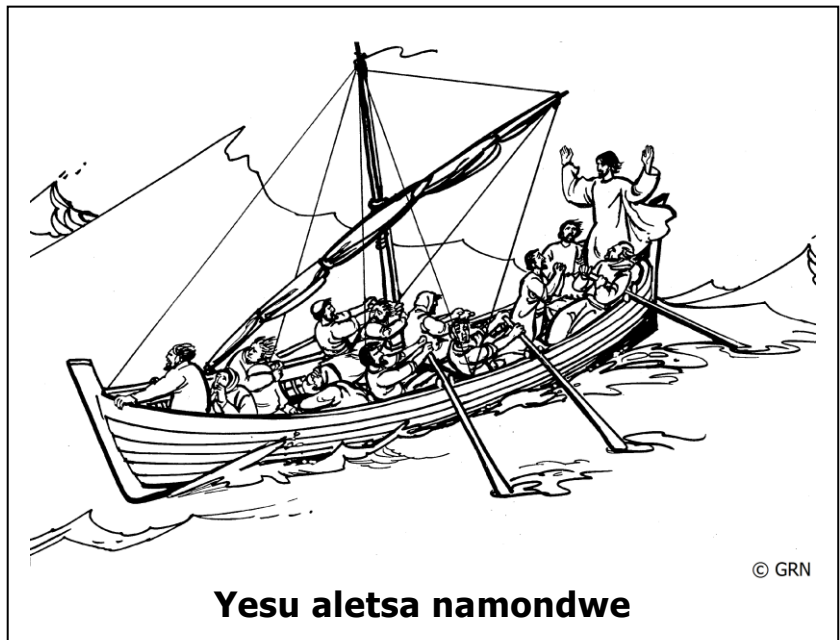
Yesu aletsa namondwe

Tsopano anachita mantha osati pamafunde koma anaopa Yesu. Anali oposa munthu anali Mulungu. Yesu anafuna kudziwa chifukwa chimene iwo sanathe kudalira pa iye kuwateteza. Pamene mitima yathu ikhala ngati nyanja ndipo sipeza mpumulo Yesu amanena chimodzimodzi kwa ife "Khala chete! Ndiri ndi iwe. Dalira ine."