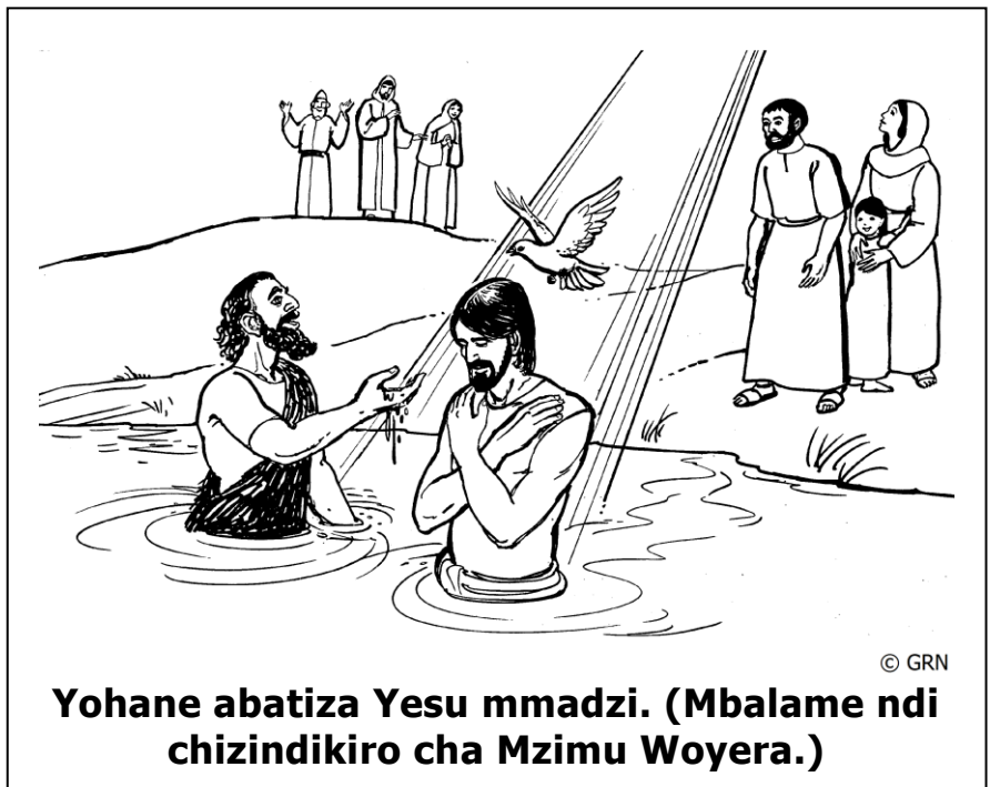
Yohane abatiza Yesu mmadzi. (Mbalame ndi chizindikiro cha Mzimu Woyera.)

Yesu anadza kuchokera ku Galileya nabatizidwa ndi Yohane mumtsinje wa Yordano (Mateyu 3:13). Yesu sadalape poti adalibe tchimo (Ahebri 4:15). Yohane anabatiza Yesu popeza kunali koyenera kutero (Mateyu 3:15). Iyi inali nzeru ndi chikonzero cha Mulungu kuti ena akatengerepo phunziro la ubatizo. Yohane anadza kudzakonza njira ya ntchito ya Yesu, monga Mulungu adakonzero.