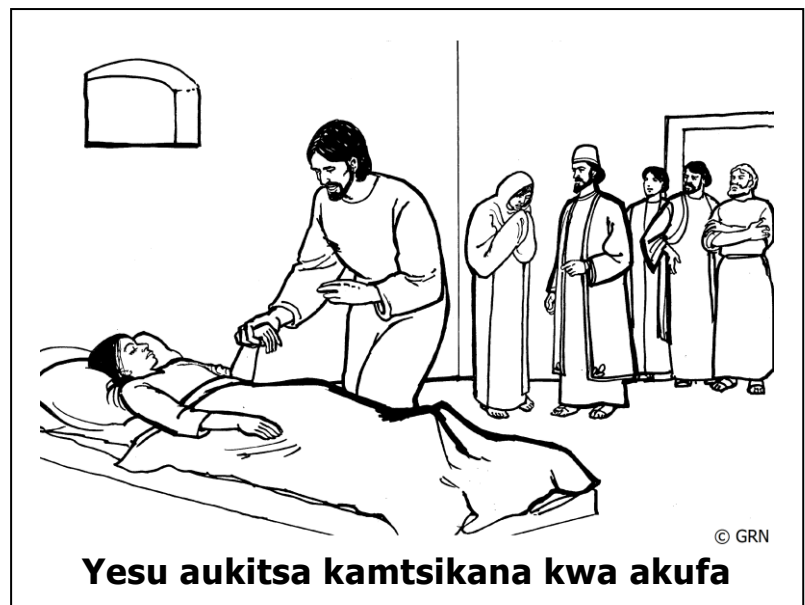
Yesu aukitsa kamtsikana kwa akufa

Yesu ali ndi mphamvu yotha kuchiritsa anthu ndi kuwabwezera moyo. Mukhudzeni iye mwachikhulupiliro. Dikirani pa iye mwa pemphero kulinga kuzosowa zanu zonse. Lye adalonjeza kuti adzayankha zonse (Aheberi 13:8; 1 Petro 5:7).